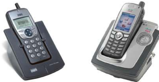
Figure 1. Mixed Environment

Cisco Unified Wireless Network Releases 4.1 and 4.2 support both the prestandard proprietary and the newer WMM QoS, allowing mixed environments that enable customers to smoothly transition to a full standards-based system (Figure 1).